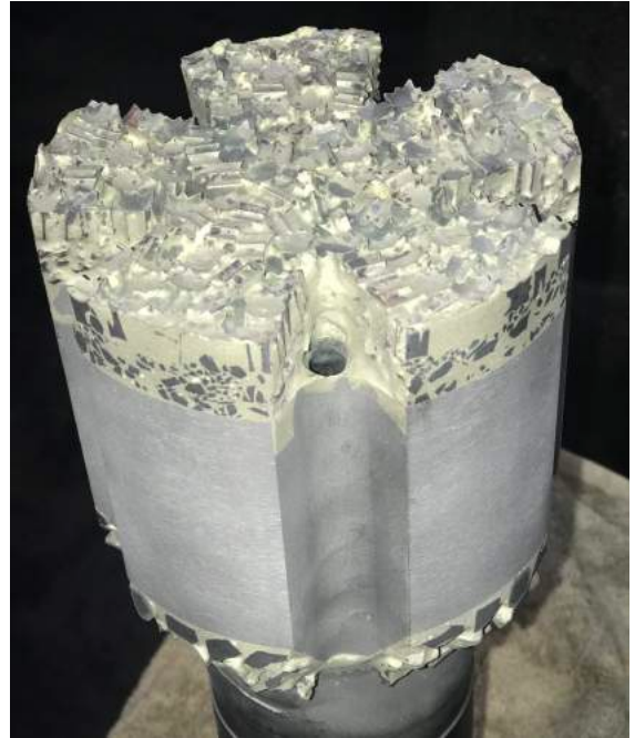
Options shown above are Extra Thickness of 1/4" Starbide chips set with massive pad shape with a closed center and large chip up drill