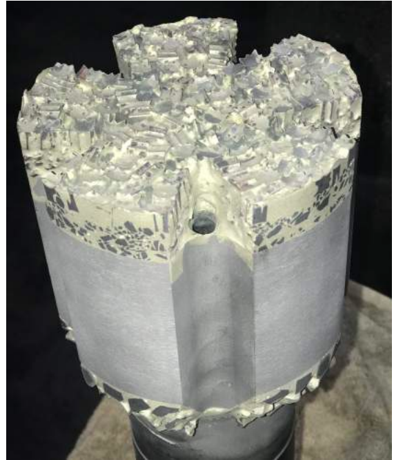
Options shown above are Extra Thickness of 1/4" Starbide chips set with massive pad shape with a closed center and large chip up drill