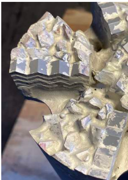
Left Chevron Inserts at left in normal stacked setting