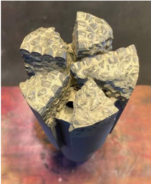
Options shown above are open center / Round Inserts backed with WC Chips

Our most common SK mills have 5 blades on shapes slight convex, slight concave, or flat bottom.