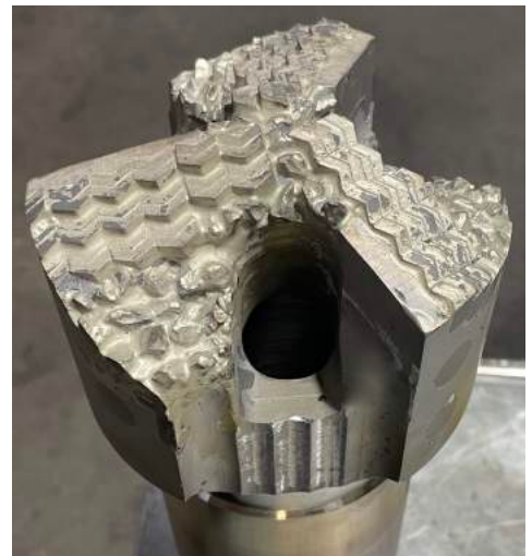
Right Chevron Hard Flat Setting